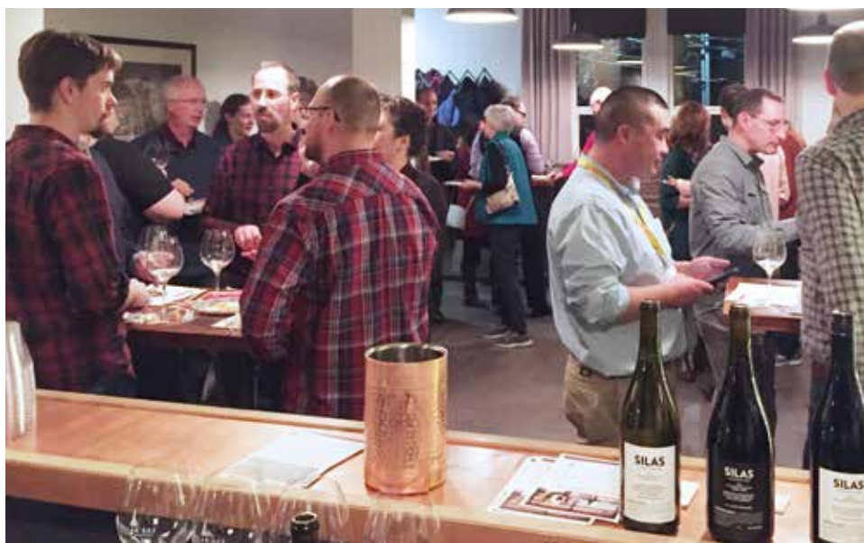
Portland Section winetasting event at Cellar 503 Dec. 7, 2017

is a combination of science and serendipity, and why flavors of wine, cheese, and chocolate pair well together. Attendees tasted 4 Oregon wines, all featured at Cellar 503, including Garagiste Blanc, a sparkling wine from Jan-Marc Cellars, Melon de Bourgogne from Grochau Cellars, and 3 wines from Silas Wines: Pinot Blanc, The Pearl Pinot Noir, and a Gamay/Malbec blend (“The Optimist”). As Alex described, the Optimist is so named because it has a hint of Brettanomyces —they decided to gamble with this one rather than play it safe!